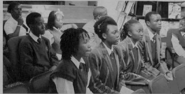
School pupils during their debating challenge at Jabavu's Ipelegeng Library.

The workshops are held in various libraries and schools or pupils who wish to participate can contact Mbambo at 072 475 3349.